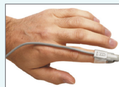
Single-Patient, SpO 2 Clip Sensor #73-989803205831 (adult/pediatric sensor)