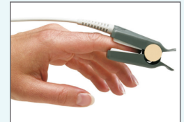
SpO 2 Clip Sensor with 9.8 ft Cable Length #73-989803205901 (adult sensor)