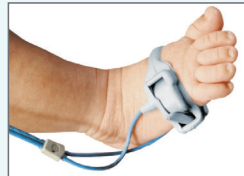
SpO 2 Wrap Sensor #73-989803205881 (neonatal sensor)