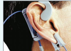
SpO 2 Ear Clip Sensor #73-989803205891 (adult/pediatric sensor)