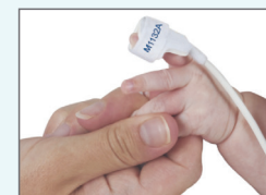
Single-Patient, SpO 2 Wrap Sensor #73-989803205841 (infant sensor)