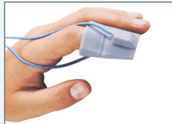
SpO 2 Glove Sensor #73-989803205871 (adult/pediatric sensor)