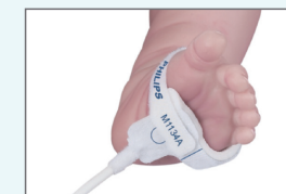
Single-Patient, Adhesive-Free, SpO 2 Wrap Sensor #73-989803205861 (neonatal/infant/ adult non-adhesive sensor)