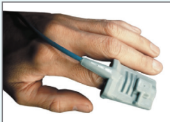
SpO 2 Glove Sensor #73-989803144371 (adult sensor)