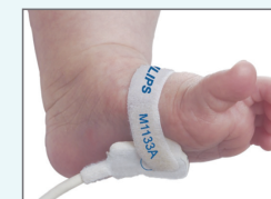
Single-Patient, SpO 2 Wrap Sensor #73-989803205851 (neonatal/infant/adult sensor)